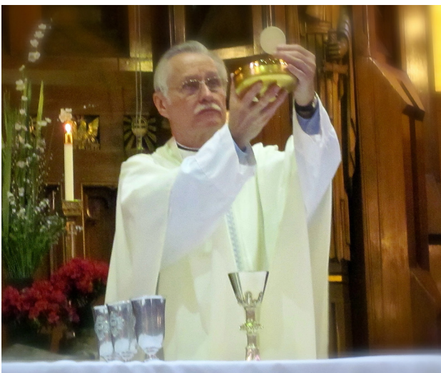
Monsignor Jim Kaczorowski during the Consecration.

I watched as a team of adults and young children worked in mostly uninterrupted silence — soundtracked by soft music and broken only occasionally by mostly whispered chatter — for the better part of an hour. I found myself disarmed and mesmerized by a silence that I realized wasn't empty or vacuous but that was rich and prayerful. It struck me that I had been invited to participate in a truly meditative moment, one that I'd have been hard pressed to replicate in my own Capuchin friary.